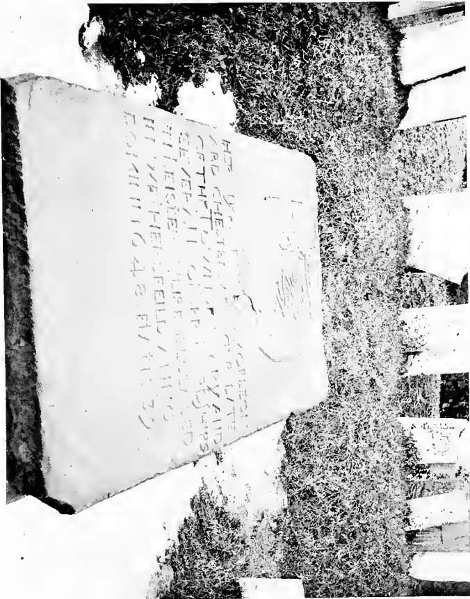
THE "LEONARD CHESTER" TABLESTONE, SHOWING THE INSCRIPTION.